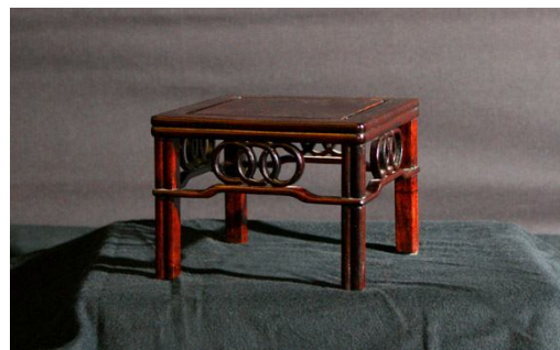
Beautiful antique stand