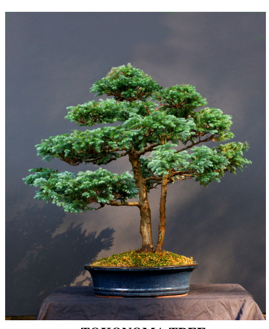
TOKONOMA TREE BOULEVARD CYPRESS (BOB PRUSKI)